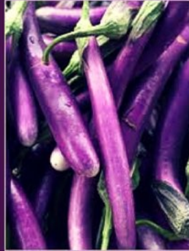
Oriental Asian cooking