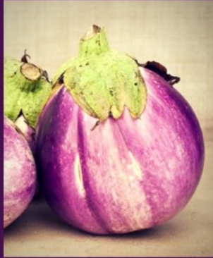
Rosa Bianca Heirloom